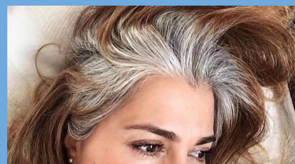
First look at next month's hot hair trend!